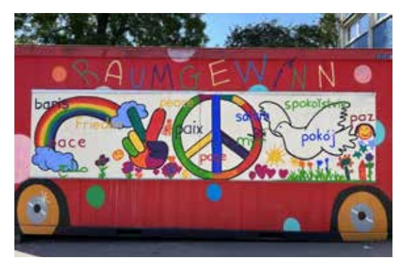
Class 3 EPC