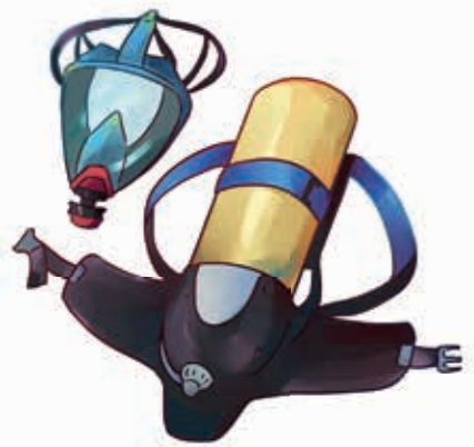
Respirator with mask