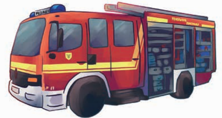
Emergency fire engine