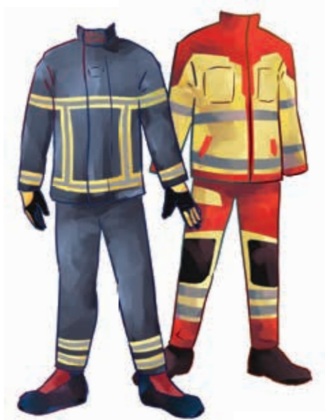
Fire brigade and rescue service clothing