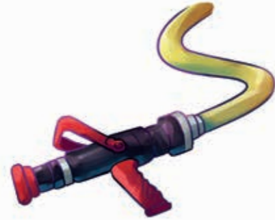
Lance with hose